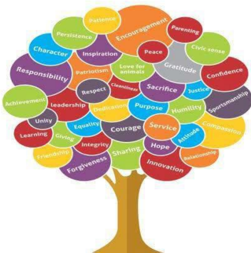
Human Values Tree